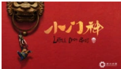
WATCH: First Trailer for Alibaba's 'Little Door Gods'