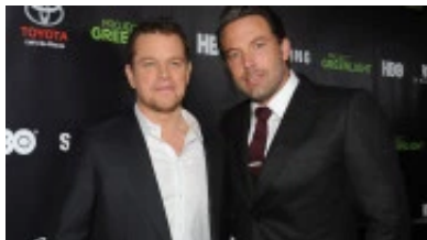
Matt Damon y Ben Affleck producirán película para HBO sobre...