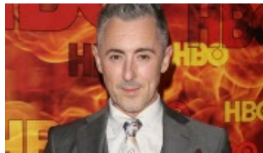
Alan Cumming to Star in Showtime's Dark Restaurant Comedy...